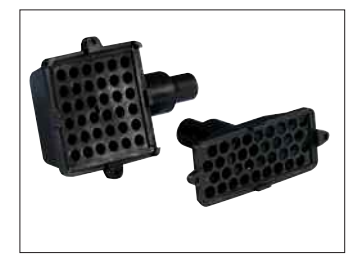
SB4222 / SB5865