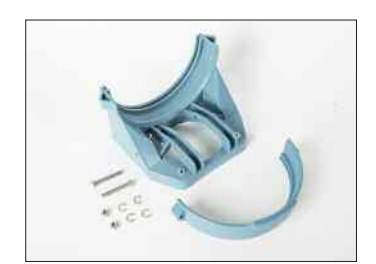
AS4409 for BP4410