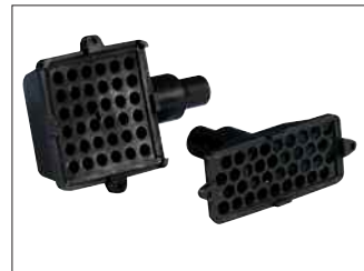
SB4222 / SB5865