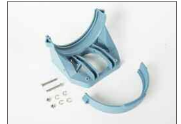
AS4409 for BP4410