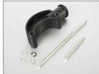
AS4408 for BP4410