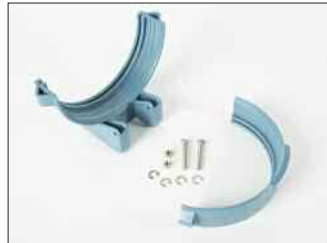
AS4407 for BP4402