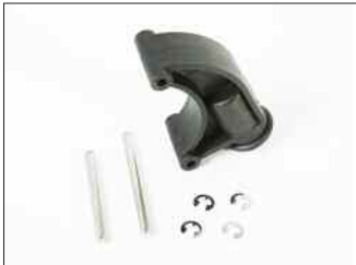
AS4406 for BP4402