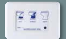
Electronic keyboard Luxe